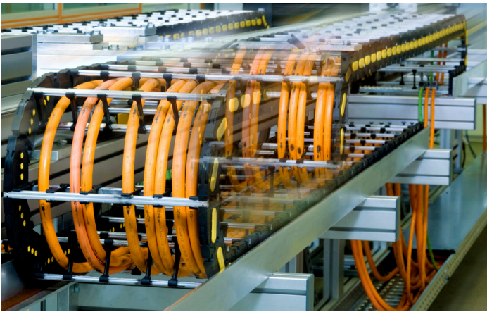
Fast-moving automation systems increasingly see accelerations high enough to shorten the life of conventional servo cables.